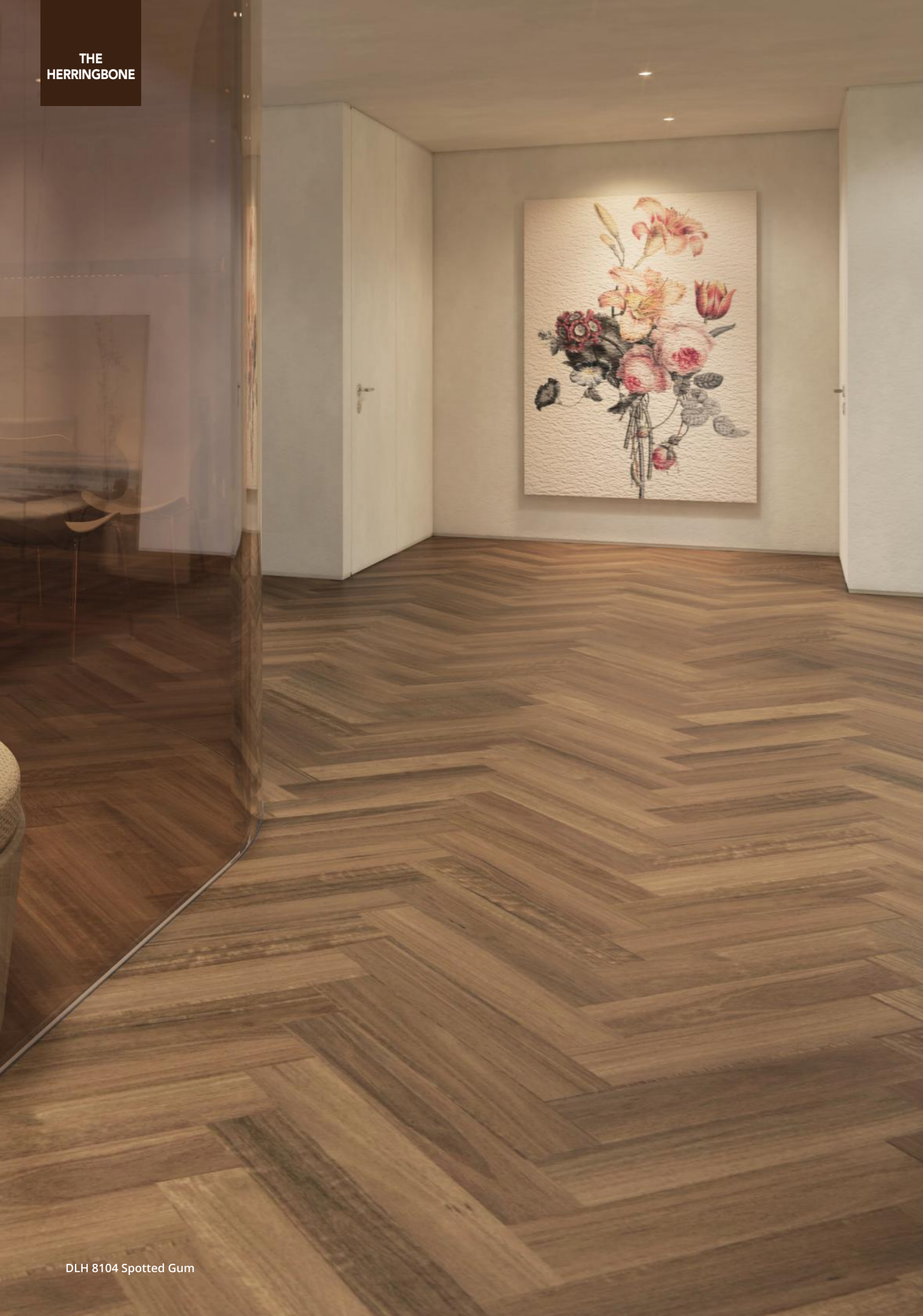
DLH 8104 Spotted Gum