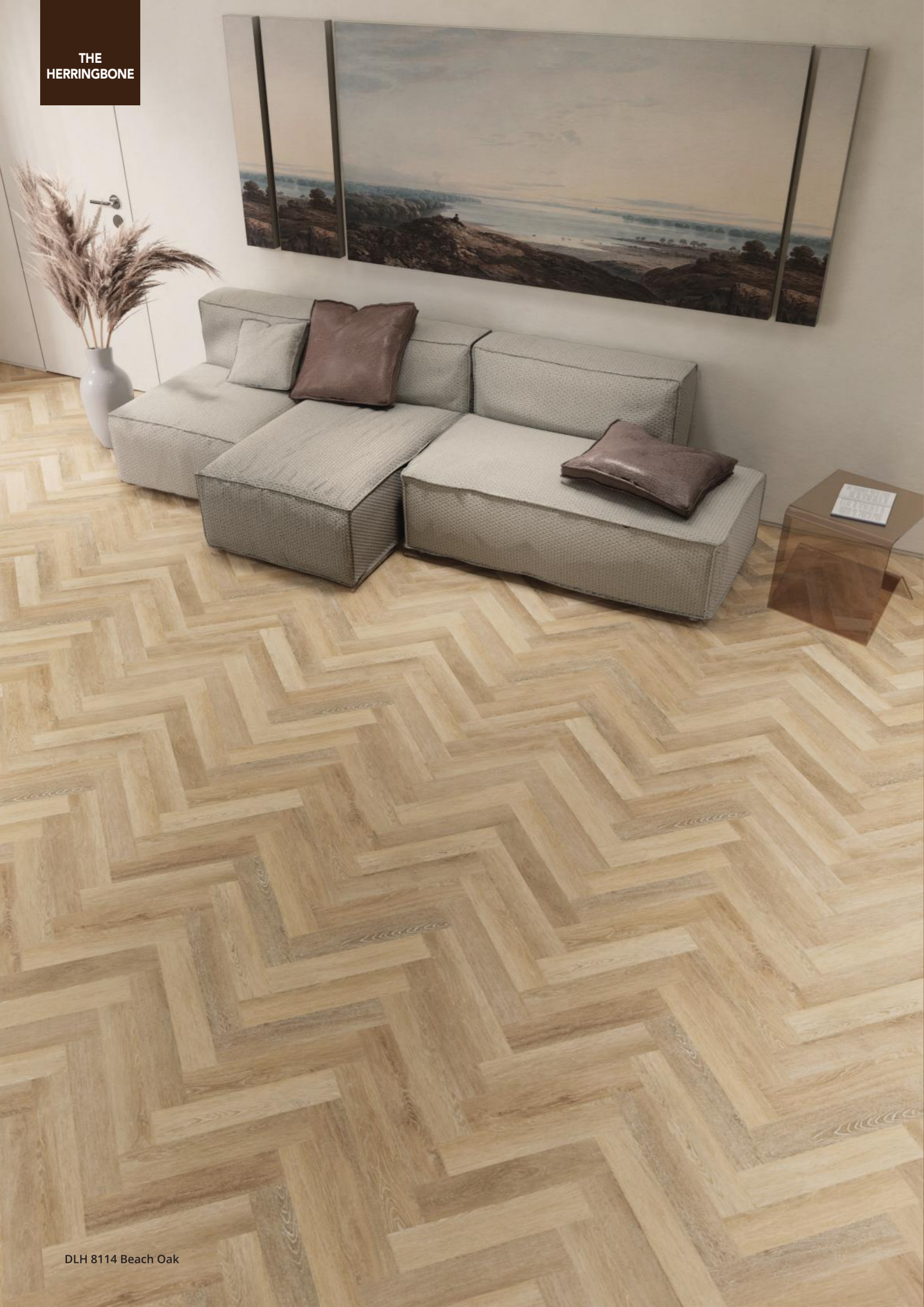
DLH 8114 Beach Oak