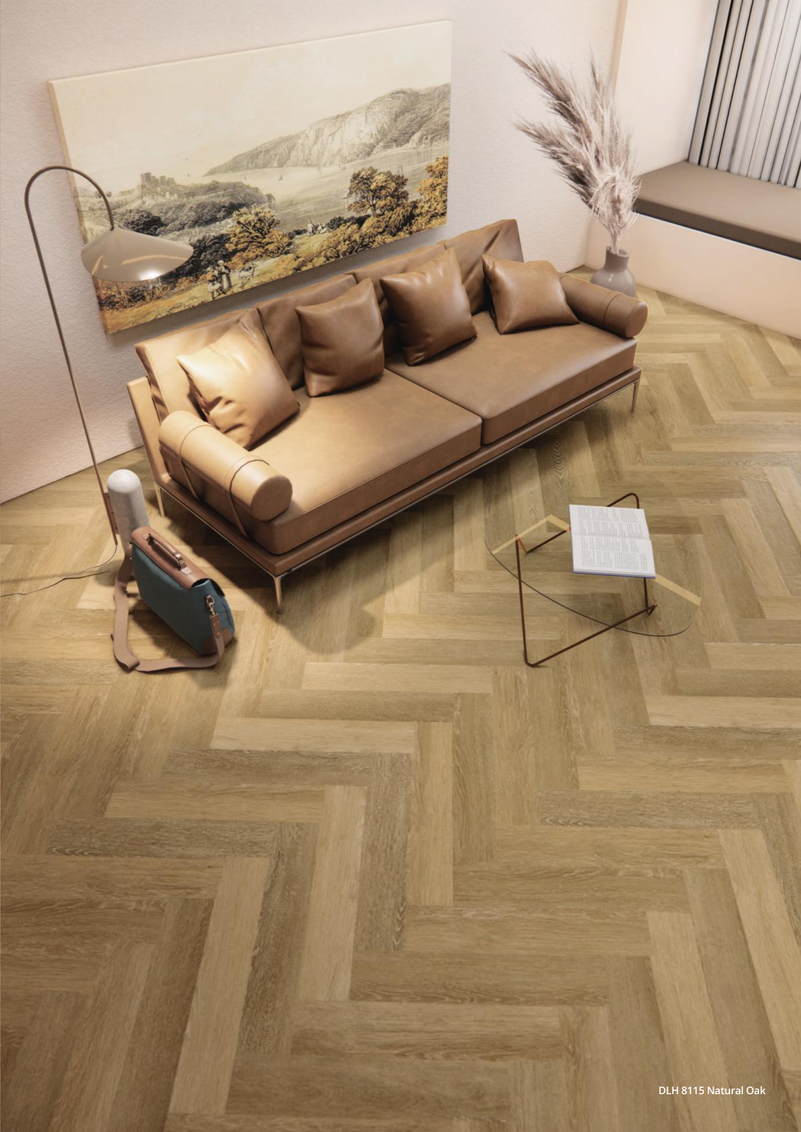
DLH 8115 Natural Oak