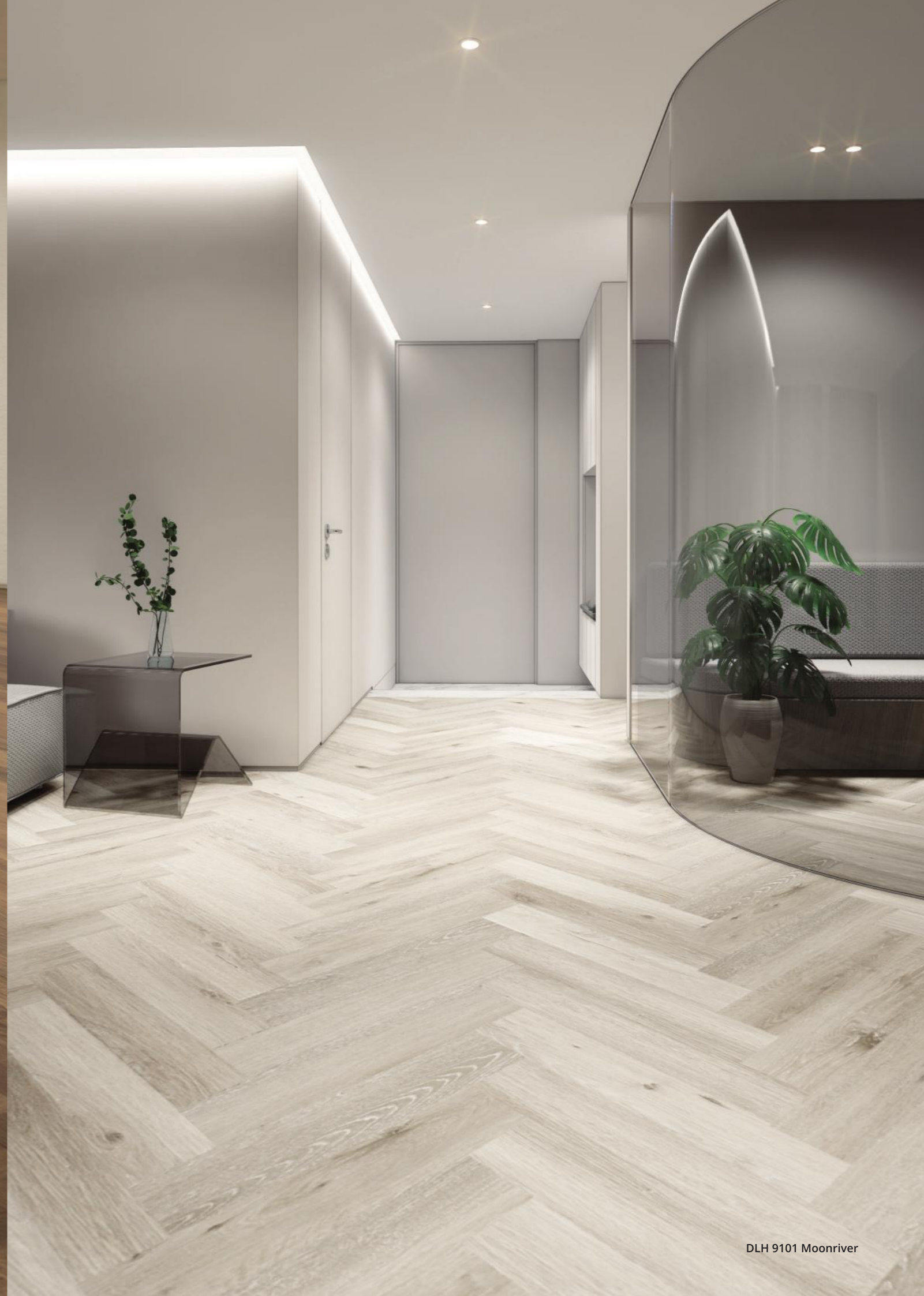
DLH 9101 Moonriver