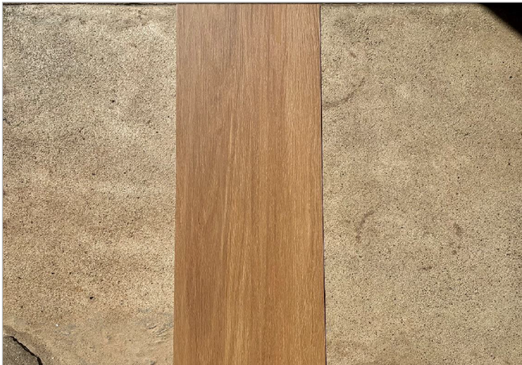
DecoLine Brown Vinyl Board 1220x228x2.5mm